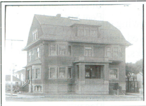
Exterior Photo of the Wright House