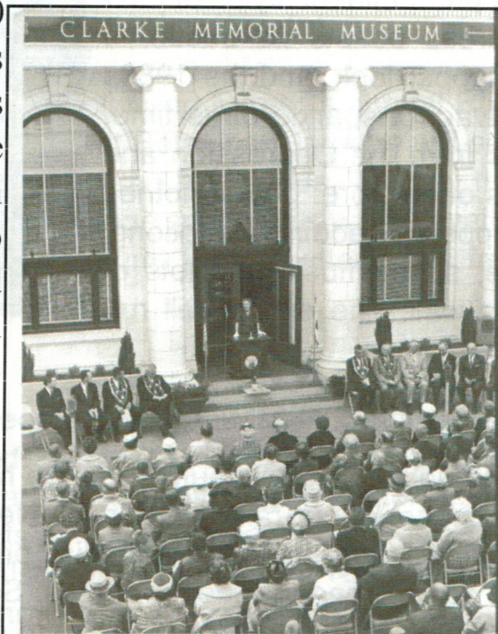
Photo from the Dedication Ceremony