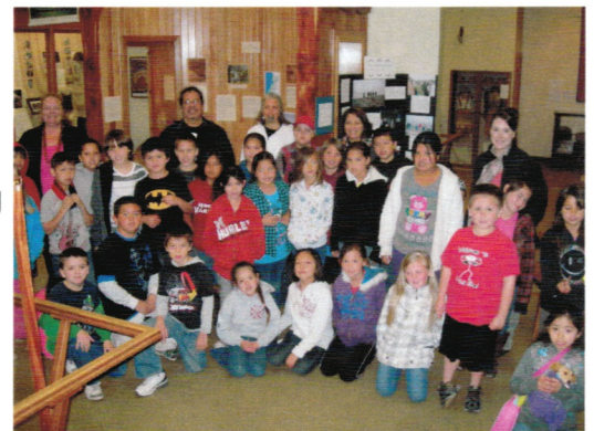
3rd grade class from Hoopa Elementary

Last year, Humboldt sponsors gave the Clarke a grant to help put together our current exhibit on the Karuk culture, past and present. This year, they came through with funding for field trips to the museum for schools in outlying areas so that kids whose heritage this is can come, enjoy and learn from the exhibit. This grant also made possible funding tour guides of Karuk ancestry. Thank you Humboldt sponsors!