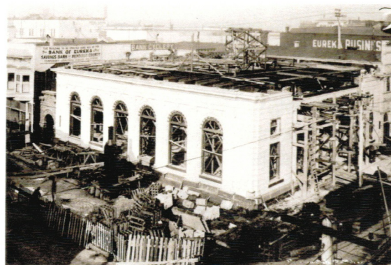
Constructing the Bank of Eureka building, 1911