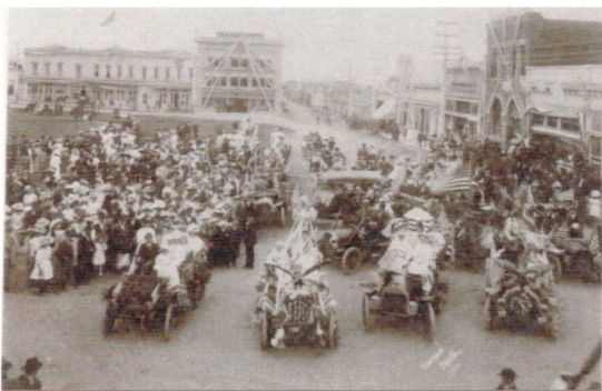
4th of July celebration, 1908 , in Arcata.

We have to come up with our half of the money to make the ornaments. That $885 is not in our tight budget. If you can pitch in any money at all, it will help the Clarke receive the recognition its beautiful building deserves — as well as the ongoing revenue it can greatly use.