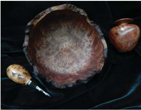
Beautiful Burl Gifts by Charlie's Woodcraft

The next time you are buying a gift, why not have it be extra thoughtful? The Clarke Museum's gift shop has a great selection of locally made and unique gifts suitable for everyone on your list. By shopping at the museum you are supporting the Clarke and local artists. Remember, there is no suggested donation for entrance to the museum if you are just stopping by to shop, so come by for a few minutes the next time you are in Old Town. Museum members receive a 10% discount on all purchases.