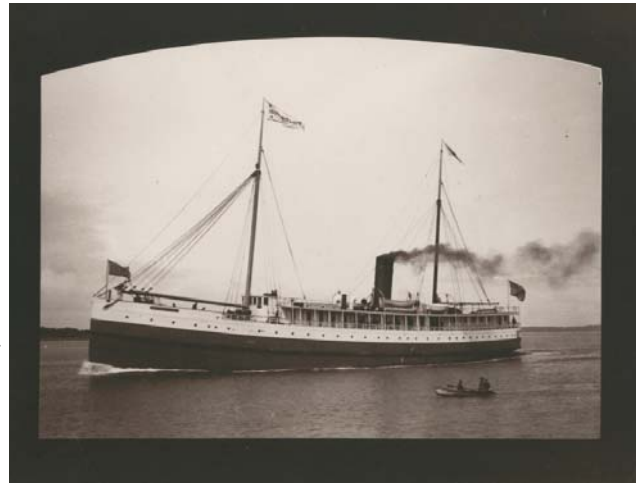
The Humboldt Steamer ran from Eureka to San Francisco. The museum has model of boat and a ticket from 1878.