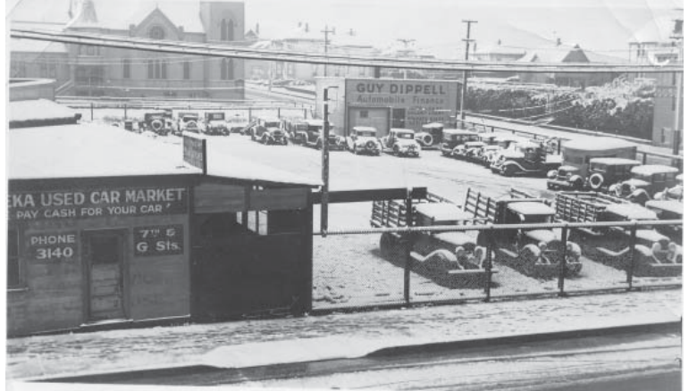
Photo: A cold day in Eureka in the 1920-30s.

The heat works! A big thank you to DG Fairhaven Power Company (located at 97 Bay Street in Samoa) for fixing the heater. The Clarke Museum would like to recognize this local company for keeping the museum visitors warm and our collections safe. The next time you need electric work, make sure to support local businesses that support non-profits.